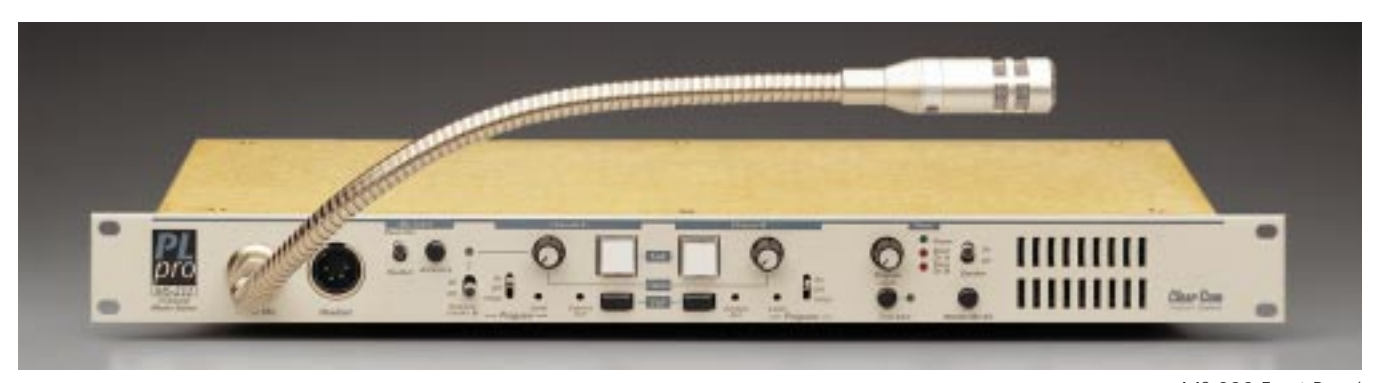
MS-232 Front Panel