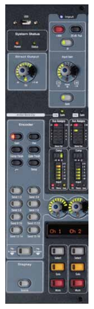
Encoder assignment and input channel strips