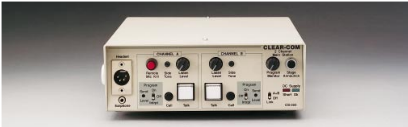
CS-222 Front Panel