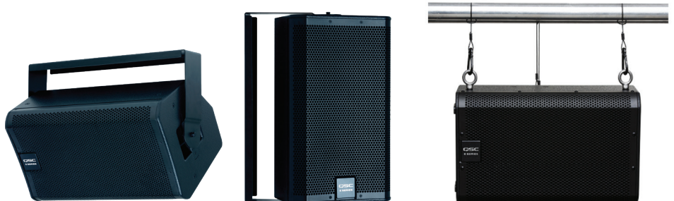
Optional Yoke Mounts shown