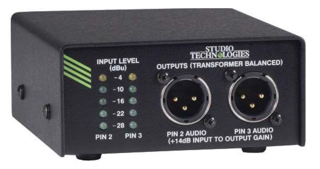
View showing level meters and audio outputs

IFB or intercom audio signals to be combined and/or routed to other local or remote talent or production personnel cue systems. Other applications may arise where an amplified speaker needs to be used to monitor an IFB or intercom circuit. The Model 72's audio outputs will make achieving this fast and simple.