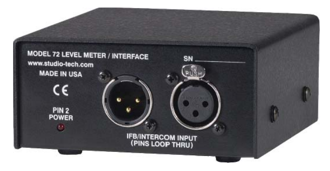
View showing IFB/intercom input and power present LED indicator

Two audio outputs provide transformer-coupled "dry" signals, one output associated with each IFB or intercom channel. These pro-audio-quality outputs are useful for a variety of production and testing applications. For example, the outputs can serve as the interface between a traditional "wet" IFB system and a wireless in-ear monitor or IFB system. The Model 72's outputs can also be connected to line-level inputs on an audio console, allowing