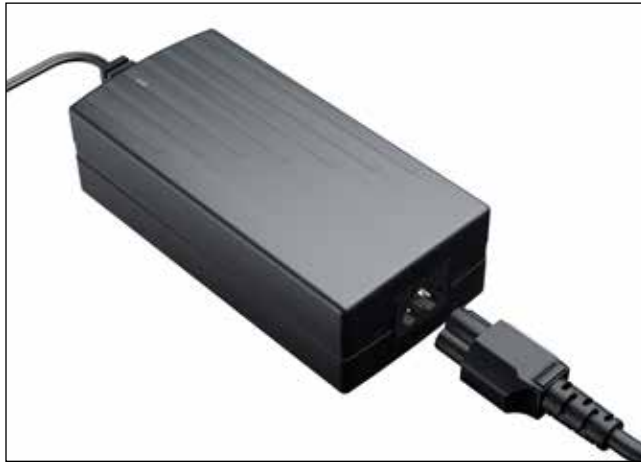
MPS-481 (shown without mounting bracket)